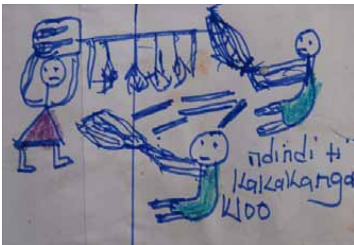
Harvesting and bundling tobacco