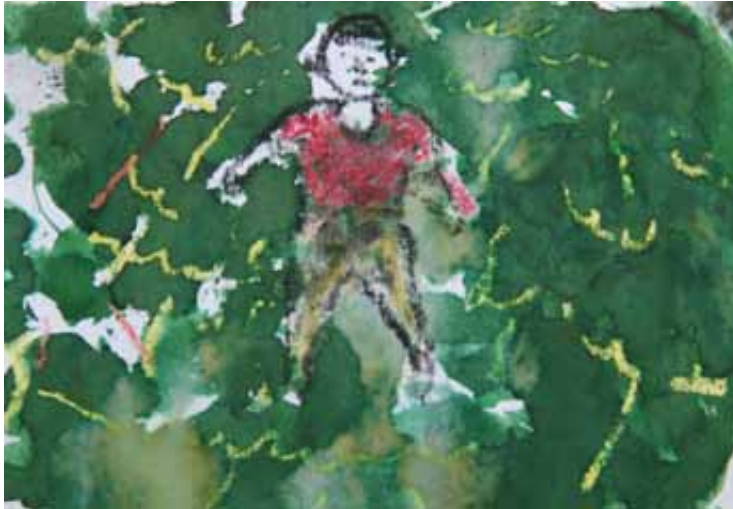
Thinking too much about my problems

Children also talked about feeling anger. The main thing that causes anger is the unjust way in which they are treated. Not being paid what they were promised is something that particularly makes children angry. Verbal abuse is another thing that makes children feel angry.