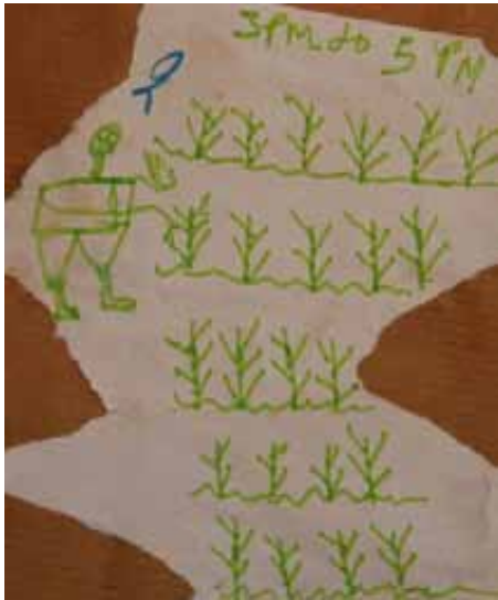
Watering in the nursery