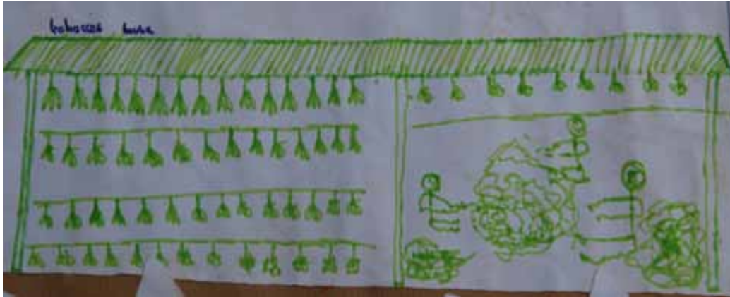
Sorting and grading tobacco